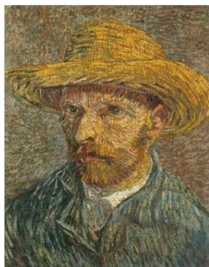
Vincent Van Gogh – Self-Portrait with Straw Hat

The one art movement that really struck me was the Impressionism which began in the mid-19 th century by the French painters like Claude Monet , Vincent Van Gogh and Camille Pissarro . Traditional impressionistic paintings feature small, visible brush strokes, accurate representation of light, and the inclusion of a feeling of motion in the composition as a crucial element of human perception and experience and unusual visual angles. Impressionists rebelled against classical subject matter and embraced modernity. Desiring to create works that reflected the world in which they lived. The artists constructed their pictures from freely brushed colours that took precedence over lines and contours. They portrayed overall visual effects instead of details, and used short broken brush strokes of mixed and pure unmixed colour, not blended smoothly or shaded, as was customary to achieve an effect of intense colour vibration.