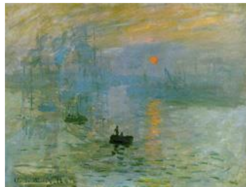
Claude Monet - Impression Sunrise

Impressionism is known for its paintings that aimed to depict the transience of light, and to capture scenes of modern life and the natural world in their ever-shifting conditions. This art movement was greatly followed by many painters as well as photographers, and the joint contribution led to give rise its sub categories such as Neo – Impressionism, Post – Impressionism, Luminism, Fauvism, etc. Among the photographers Edgar Degas, Freeman Patterson,